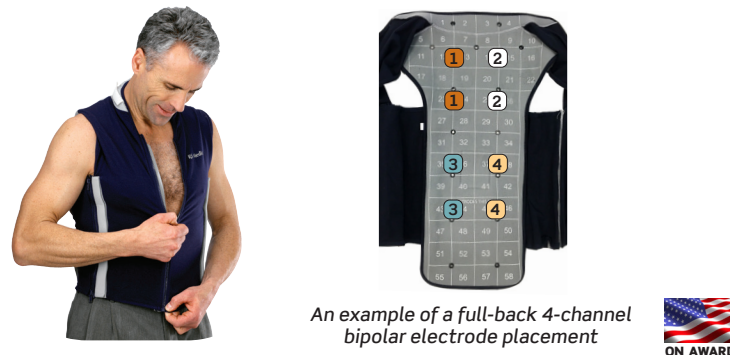
An example of a full-back 4-channel bipolar electrode placement

A total of eight (8) electrode pads are included for initial use. Humidity, skin preparation and storage will age electrodes. Monthly resupply is 2 packs (4 pads per pack) of electrode pads.