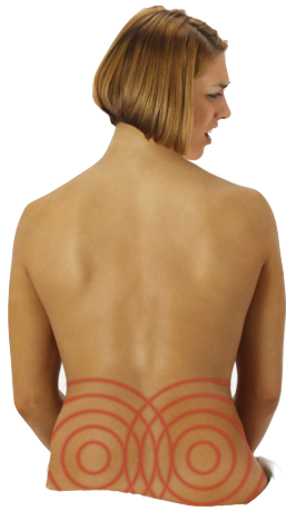
Before Treatment: Painful muscle condition

The RS-4i Plus combines high frequency interferential current for pain relief and muscle stimulation for rehabilitation in a patent-pending treatment program known as Intersperse ® , which delivers both therapies in a single, customizable treatment session that is effective, comfortable and convenient. The RS-4i Plus is a non-addictive alternative to common drug therapies, including opioids.