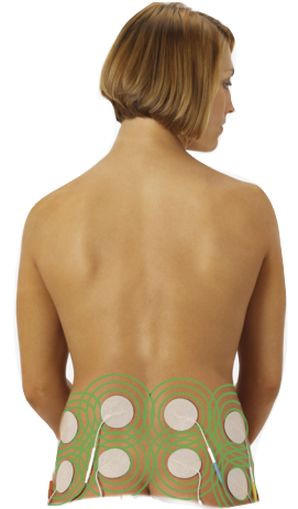
Segment 3: 25 minutes of Intersperse ® , which combines pain relief and muscle therapy